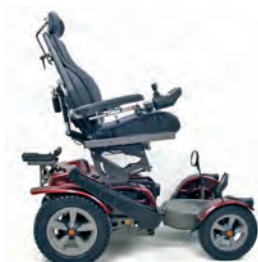
Seat lift 200 mm