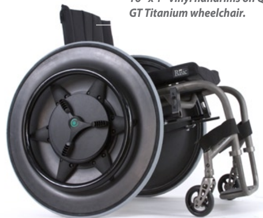
2-gear wheels with higher performance 16" x 1" vinyl handrims on Quickie GT Titanium wheelchair.