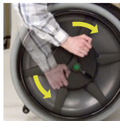
Easily shifted with palm of hand: 1:1 gear for flat surfaces; 2:1 gear with hill-holding for inclines.

The innovation behind the MAGICWHEELS™ technology is the hypocycloidal reduction drive —a patented gear mechanism which creates unique loading and friction characteristics. Engaging the 2:1 gear acts much like low gear on a bicycle; the rider exerts half as much effort to negotiate the same grade. The mechanism also offers more downhill braking control and automatic hill-holding (with seamless override). On hills, individuals can stop to rest, answer their phone, or just enjoy the view.