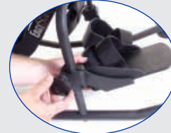
Foot Plates (plantar/dorsi, toe-in/toe-out)

"I like that the EasyStand is designed with the ability to add or remove a variety of options as needed."