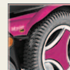
POP STAR PINK