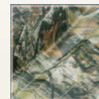
REALTREE AP CAMO