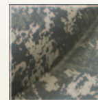
DIGITAL ARMY CAMO